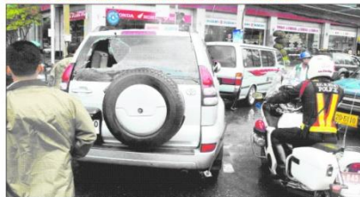
The car carrying Thai Prime Minister Abhisit Vejjajiva had its rear window smashed by riot-armed protesters yesterday in Pattaya, where he was holding a weekly Cabinet meeting. About 50 protesters surrounded his motorcade when it ran caught in traffic. He himself escaped unscathed. Earlier, the protesters had surrounded the hotel where he was holding the meeting.